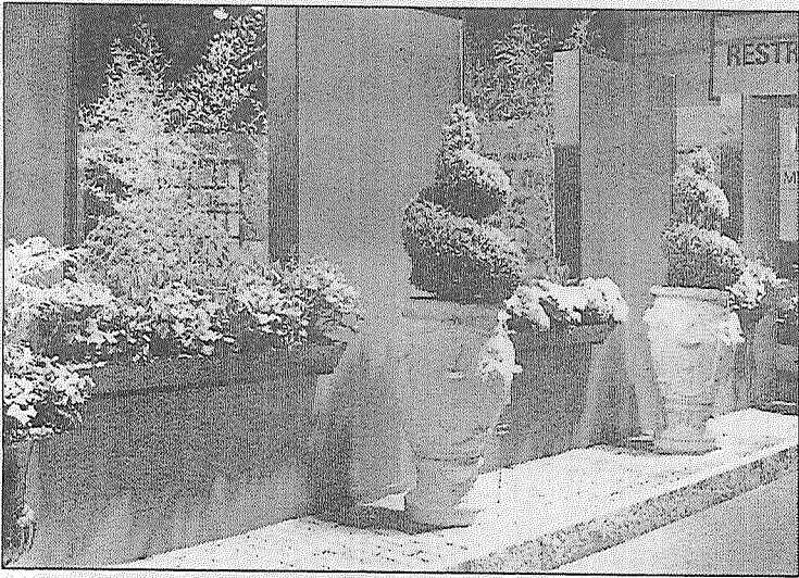
ZEN Associates' exhibit at the March 12 flower show.

planning for me. But, some of my favorite spots are popular with both locals and tourists so booking the tables for meals at the same time as hotel reservations is a great idea. When planning a trip, myself or read through the conversations to learn the latest recommendations, find out about new places that have opened since my last visit, and add to my list of spots to try while I'm visiting. Do you have a question or