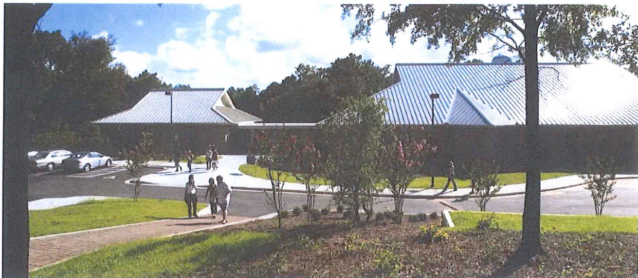
Photo, top: Building exterior was designed to blend with campus architecture. Below: Tearoom interior.