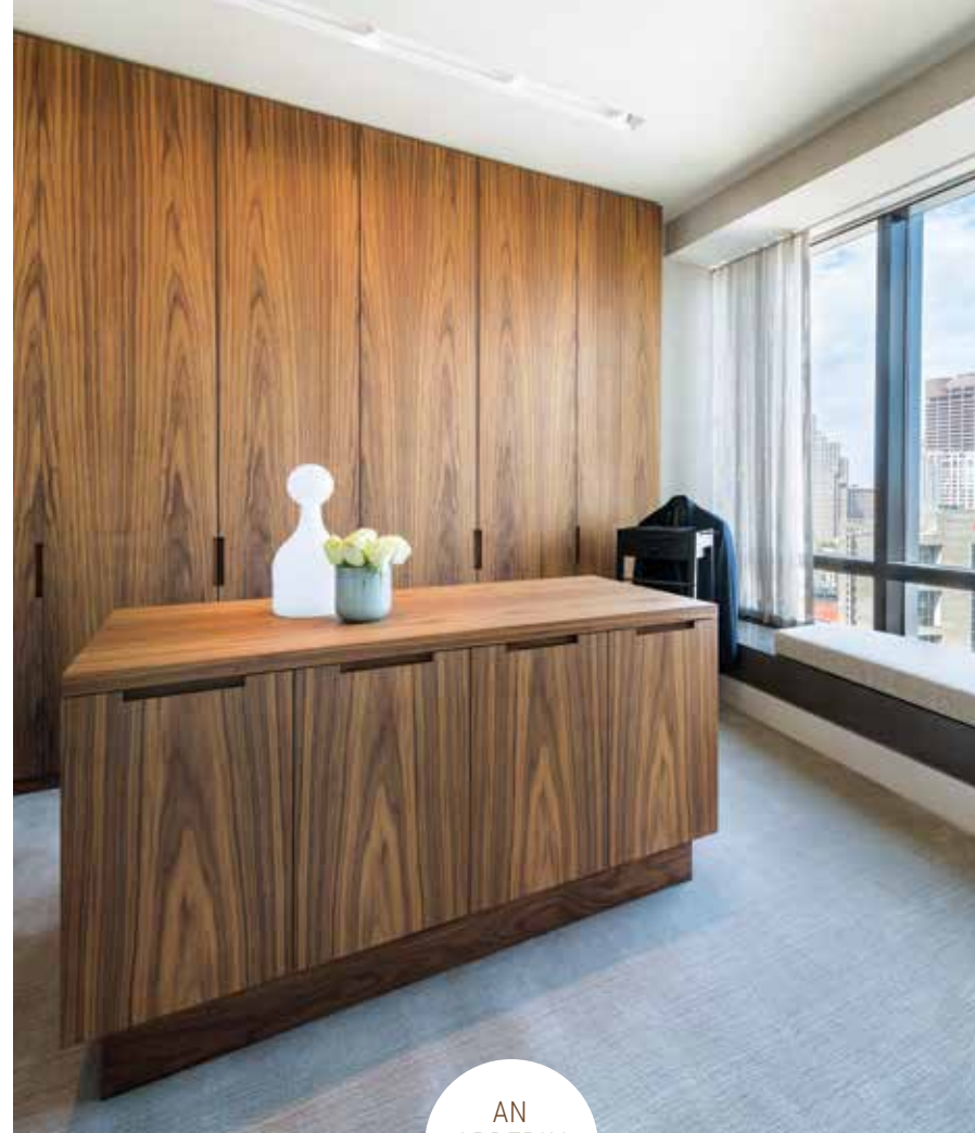
AN ORDERLY OASIS

RESOURCES For more information about this home, see page 74.