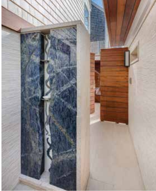
ABOVE: The outdoor shower gets a spa-like look with blue granite walls. LEFT: The lower-level deck takes on a contemporary vibe with its French limestone tile flooring and a low wall of stone supplemented by soft plantings behind the chaises. BELOW: The bar is a stylish mix of French limestone and black granite; the doors behind it open to storage.

to tease it out. The house—a classic rambling cape—sits on a high bluff overlooking Wellfleet Harbor. The existing pool, White explains, was a dated kidney-shaped rendition that sat some fifteen feet below the house. “You couldn’t easily get to it,” the landscape architect says. “Our task was to make it feel more connected with the house.”