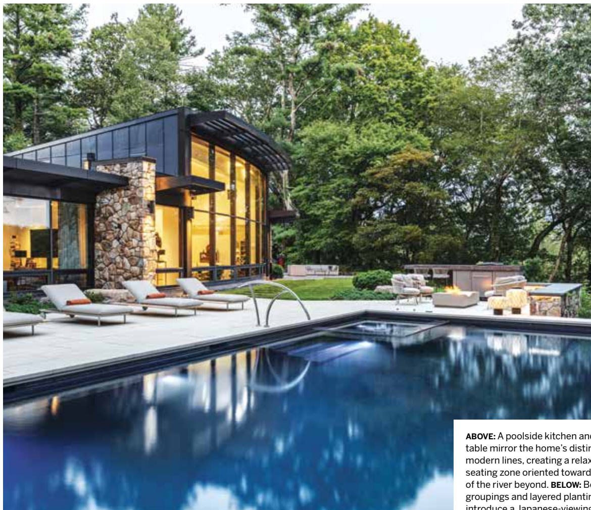
ABOVE: A poolside kitchen and fire table mirror the home's distinctive modern lines, creating a relaxed seating zone oriented toward views of the river beyond. BELOW: Boulder groupings and layered plantings introduce a Japanese-viewing-garden sensibility on the way to the backyard, establishing structure and rhythm.