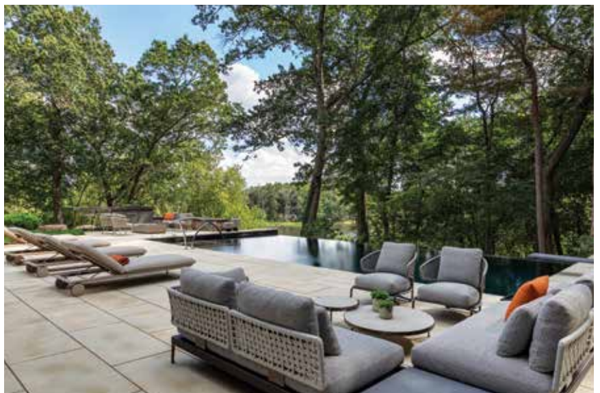
TOP TO BOTTOM: Positioned just off the home's primary sight lines, the negative-edge pool delivers drama without competing with views of the Concord River. Generous lounge seating between the house and pool creates a relaxed gathering zone where adults can socialize comfortably while keeping an easy eye on kids in the water.

Working within a conservation buffer zone, White placed the pool off to the side of the home's primary sightlines, allowing the river to remain the star. Pushed to the edge of a natural slope, the pool becomes a negative-edge feature, its water quietly spilling away while preserving generous space between house and pool for lounging, socializing, and sun.